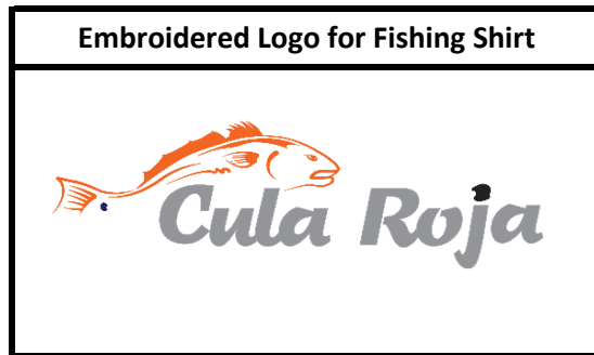
2024 Official Cula Roja Logo